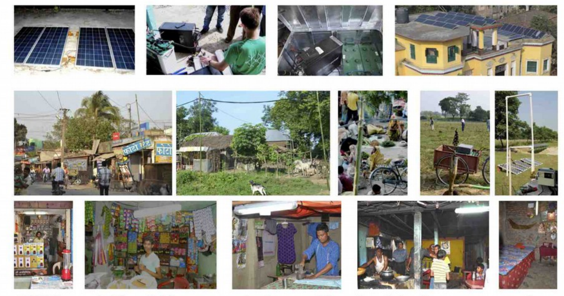
DESI Power's Tiny Grids can supply the need for electricity for water pumping, mobile charging and lighting of small shops and households in an affordable manner. DESI Power is going to build 40 Tiny Grid units to optimise the system, strengthen its delivery capacity and demonstrate the profitability of Tiny Grids which have the potential to provide power to under- and un-serviced villagers on a very large scale and non-polluting power in small towns.

Totally, DESI Power's Micro Grid and Tiny Grid projects are currently working in 14 villages and bring direct benefits to about 2000 people.