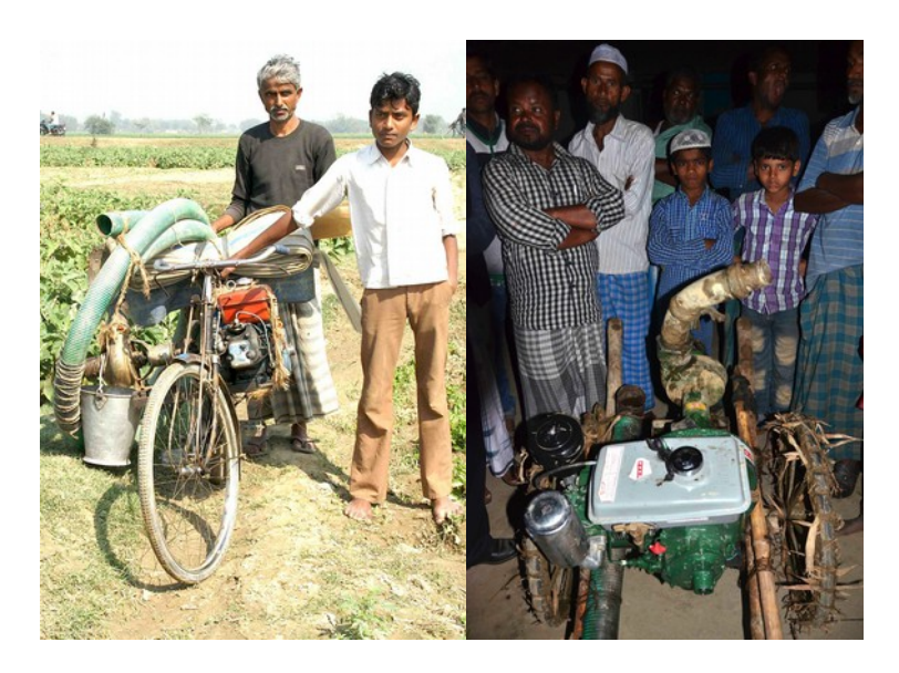
Tiny Grids will Replace Diesel Engines used for Irrigation Pumping

Thus in a 1.2 kW Tiny Grid shared by 15 households the emissions reductions will be 5.7 tCO<sub>2</sub>/year. For the 40 Tiny Grids in the Dasag REPIC Tiny Grid project the reductions will be 228 tCO<sub>2</sub>/year, and for 1000 Tiny Grids in the replication/multiplication phase the reductions will be 5700 tCO<sub>2</sub>/year.